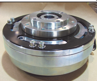
Ogura MMC electric clutch

The mill blades turn between 4 and 240 rpm.