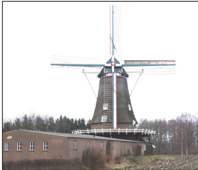
Windmill and restaurant “De Zwiapsemolen” Zwiepse/Lochem NL

There is a 10:1 speed up ratio between the wooden gear and the customer plastic roller gear. So, the generator turns between 40 and 240 rpm. If wind speed causes the wheel to turn faster than 240 rpm, the clutch is automatically disengaged to protect the generator. Also, if the miller wants to grind grain and not utilize the generator, the clutch is not engaged increasing the overall life of the generator.